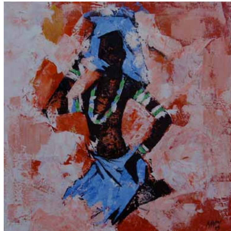
Fishermen 60 x 60 cm