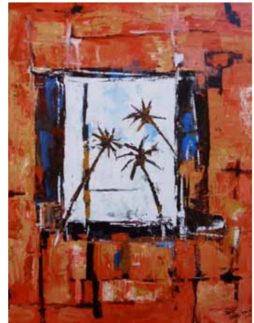
Window 79 x 100 cm