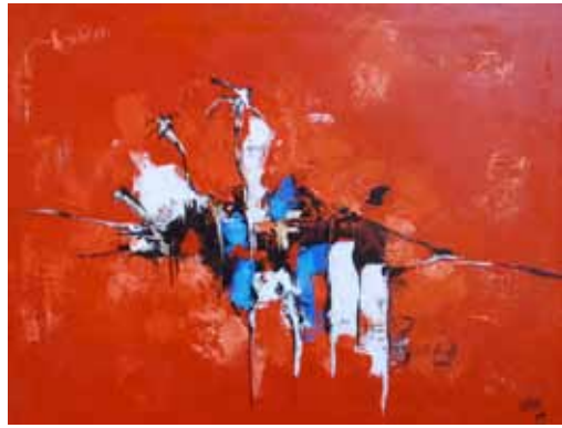
Bull's Head 80 x 78 cm