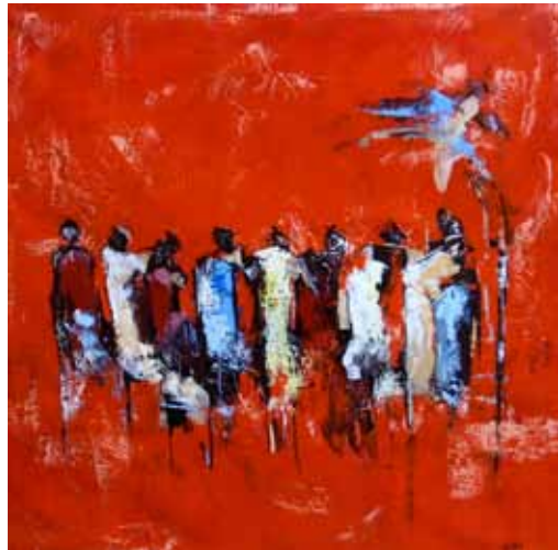
Coconut Trees 80 x 60 cm