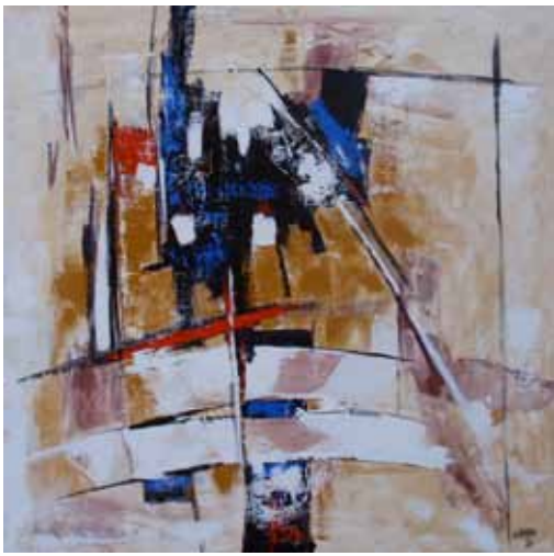
Mask 80 x 79 cm