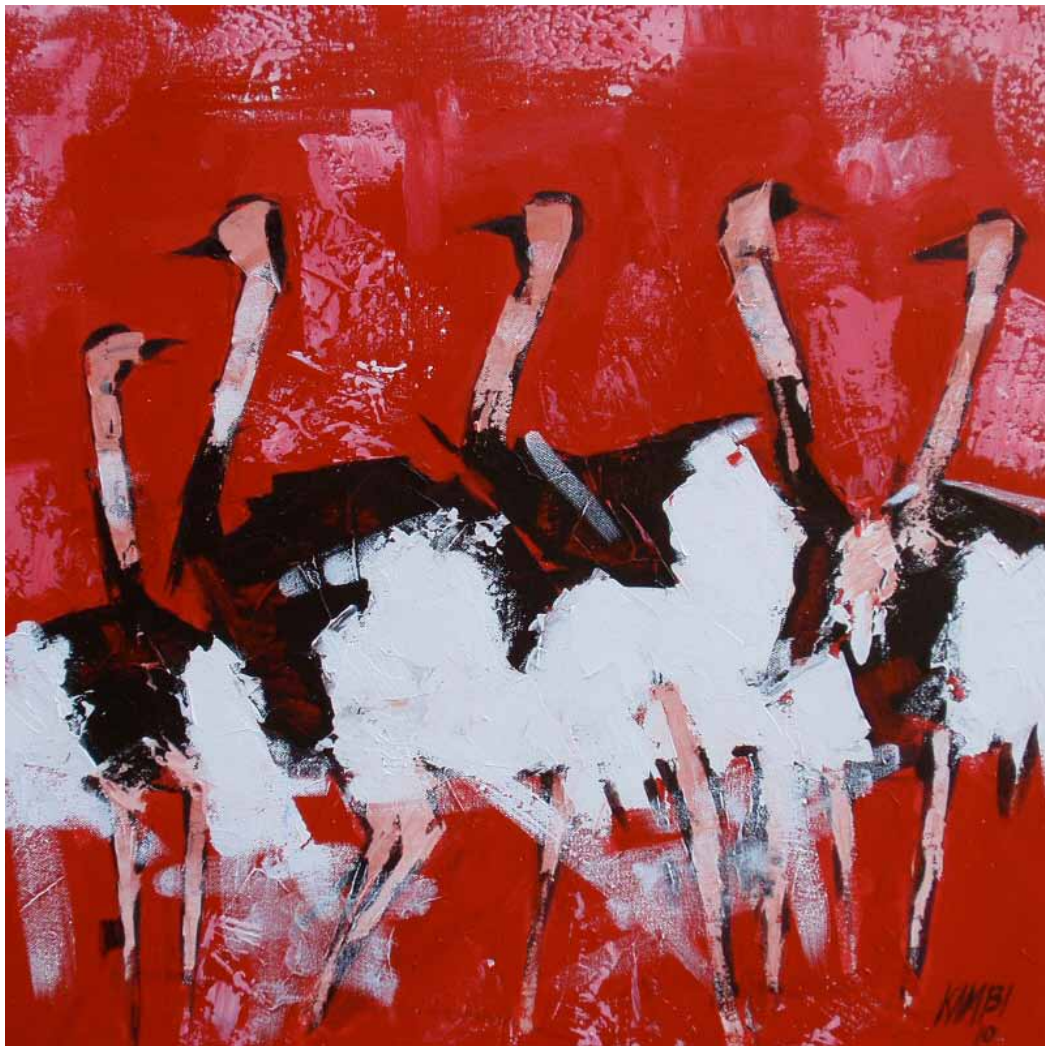
Ostrich 60 x 60 cm