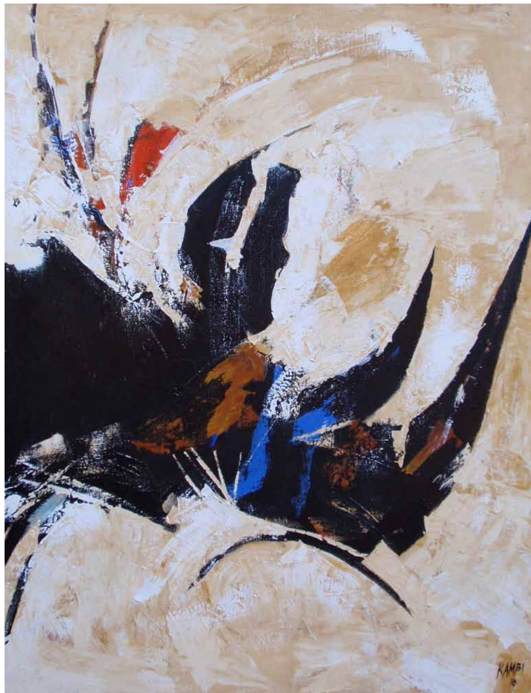
Birds 100 x 70 cm