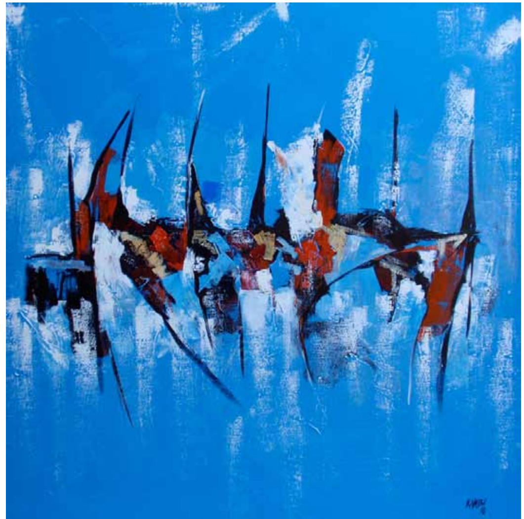
Untitled 120 x 120 cm