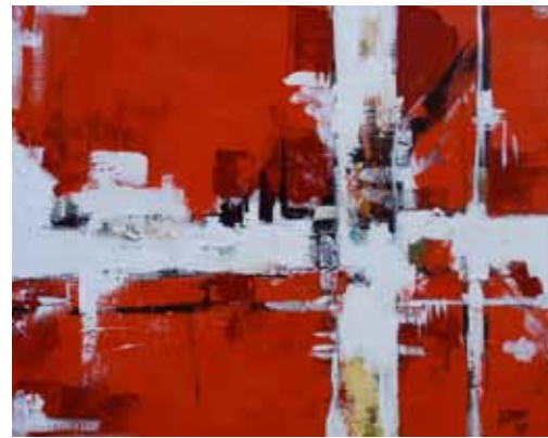
Flag 71 x 56 cm